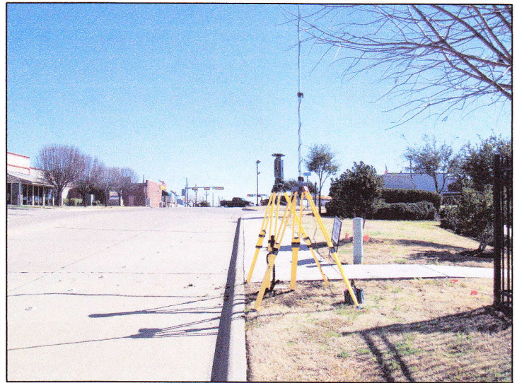
PHOTO TAKEN FROM THE WEST LOOKING EAST TOWARD MAIN ST. AND WESTPORT DR.